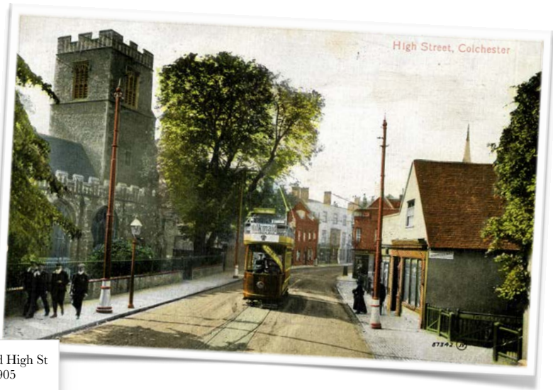
All Saints and High St circa 1905