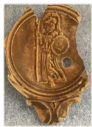
Roman lamp fragment

Another object loaned for the exhibition is part of a Roman lamp that was produced in Lyon but found in Colchester. The lamp depicts Minerva, the Roman goddess of war.