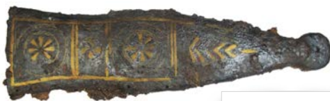
Iron dagger scabbard

It dates to Camulodunum’s earliest phase of habitation and was likely used by a soldier during the establishment of the town.