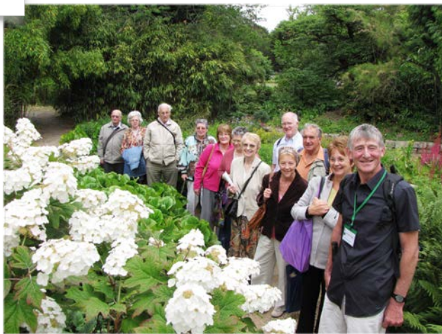
Members of the Friends pictured on a visit to the Botanical Gardens at Cambridge in 2011