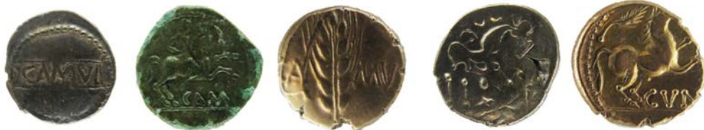
Roman coins from the reign of Cunobelin