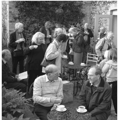
Friends enjoying the refreshments and a chat