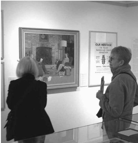
Two Friends viewing one of the many exhibits