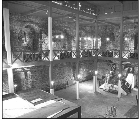
The empty Castle

There was an eclectic mix of other special events including a four day beer festival, a zombie invasion, an Elizabethan evening, a vintage fair, and a wedding reception. Students from the Colchester Institute performed Julius Caesar , played at the 'Castle Rock' music evening and supported the 'Knight School' event where school groups learnt about life in medieval times. 11,581 people visited in total which was a 56% increase on the equivalent