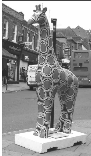
One of the Giraffes on display in Head Street

On Wednesday 3rd July we joined forces with members of the Colchester Recalled Oral History Group for a most enjoyable visit to