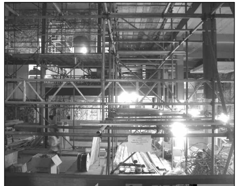
The building work starts