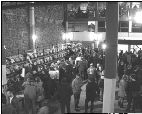
The very popular 4 day Beer Festival

The local building firm, Huttons, who were appointed on 28th January to carry out the main building works at Colchester Castle, have insulated the roof and are currently preparing to install the under floor heating. Completion of the new lift and toilet block will follow. The scaffolding that has filled the inside of the Castle since April will shortly be taken down. At the same time scaffolding is going up outside as Bakers of Danbury begin the repairs to the north, east and south walls which will be completed in the Autumn.