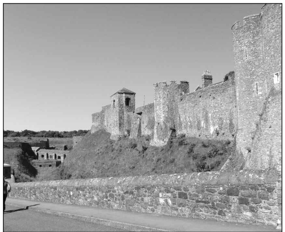
The impressive Dover Castle