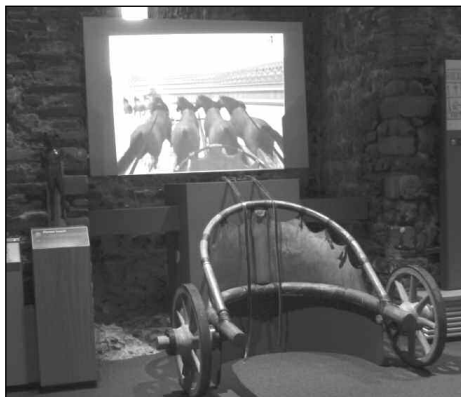
ABOVE: The Chariot Race, inspired by the Roman Circus, the only one found so far in Britain.

the fighting gladiators and the hunting dogs that decorate the vase.