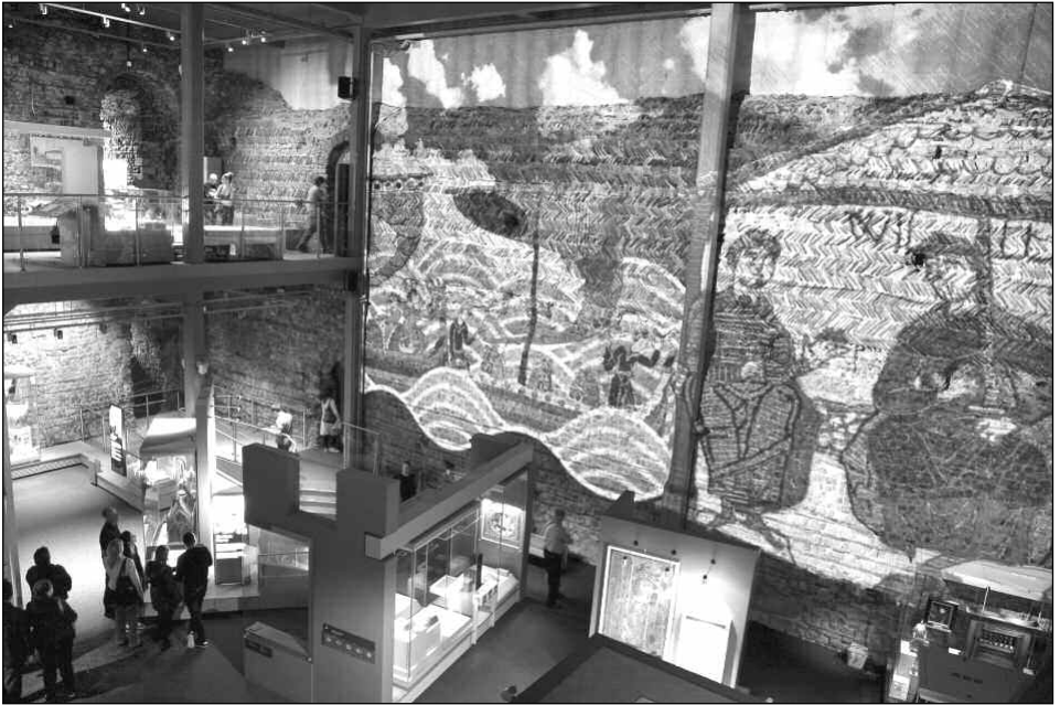
ABOVE: The Light projection highlighting the long history of the Castle site.