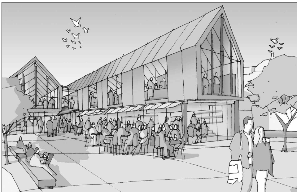
The view from the South East

the ancient Town Wall, including the interior of a medieval bastion, that have been concealed from public view in the bus depot since the 1930s. The work will include creating a new public access route through the Town Wall (using an existing doorway) that connects the Wonderhouse with Priory Street car park, St Botolph's Priory and Colchester Town railway station.