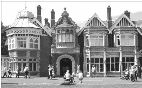
The mansion at Bletchley Park

In these we saw office displays from the time of the war and exhibitions showing how the personnel attempted to break the codes. There were also electronic puzzles and conundrums to help us understand the laborious processes necessary to break the codes.