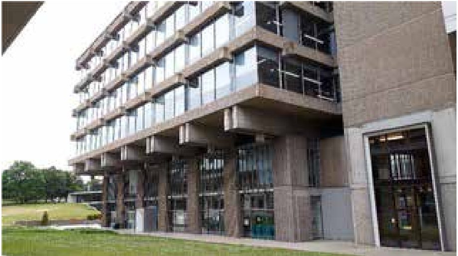
Albert Sloman Library at the University of Essex