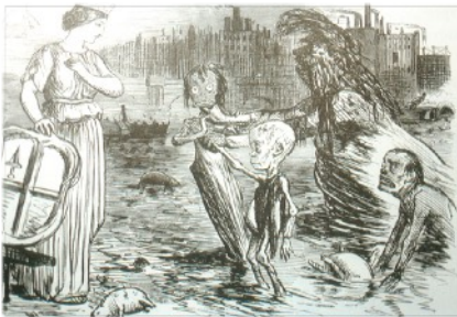
A cartoon from Punch magazine in July 1858 showing Old Father Thames presenting his offspring (various diseases), to the city of London at the time of the Great Stink

We start in Chancery Lane, London for coffee in a pub (with wonderful loos) then our guide will tell us about "spending a Penny" in London, also the Roman sewage systems, the underground rivers and wells of London and the Thames. Gradually the pollution was so great that in 1858 the Great Stink from the Thames was so bad Parliament could not sit. Sir Joseph Bazalgette arrived with his amazing engineering feats and we end the day visiting his spectacular Cathedral of Sewage, the pumping station at Crossness.