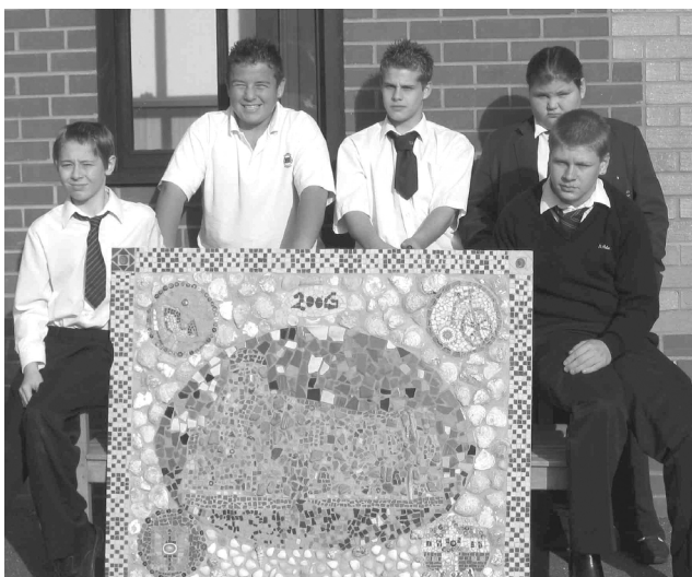
The Mosaic created by the young people of the behaviour support unit at Copford

Next to the lift entrance on the first floor there will soon be a mosaic created by the young people of the Behaviour Support unit at Copford. It features images taken from three projects the museum has been involved in with the unit. There is a penny farthing, a Roman shield, and a civil war helmet. There is also an image of the unit itself. The centrepiece is a magnificent representation of the Castle using in part pieces of Roman material.