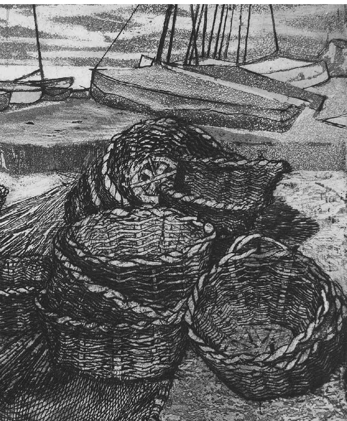
Oyster Baskets: the etching by Charles Bartlett

As part of Colchester Borough Council's annual Re-Create