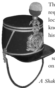
A Shako Military Cap c.1875

The display is a direct response to feedback from local residents who asked to know more about the history of the armed forces in Colchester and will provide a rare treat to see items not permanently on display.