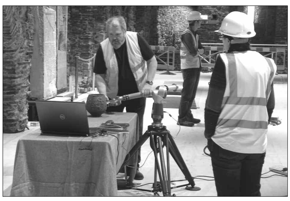
Laser scanning the Colchester Vase, 4th November