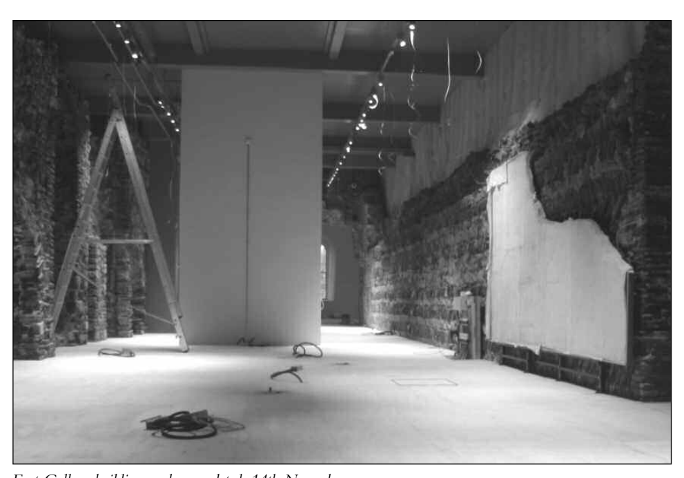
East Gallery, building works completed, 14th November