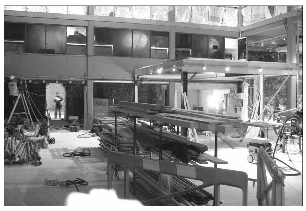
Ground floor, 14th November