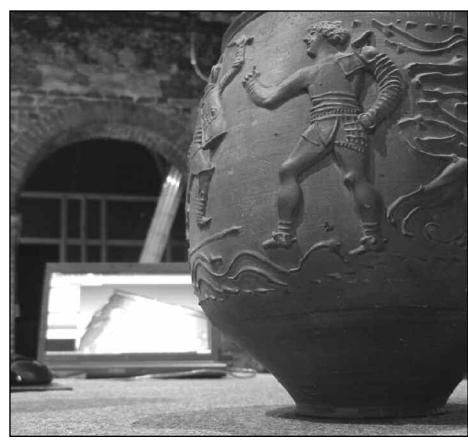
Colchester Vase, 4th November

The scaffolding that you will have seen around the Castle has been for a separate project by Bakers of Danbury who have been cleaning and consolidating the external walls. The lengthy hot and dry spell we had earlier this year slowed up their work because the lime mortar could only be mixed in small quantities. As a result the south east corner of the Castle will have to be finished next summer.