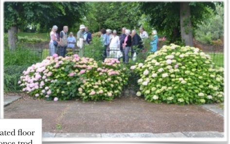
Admiring the tessellated floor where Roman feet once trod

There are many Roman remains just below the surface including house foundations, roman streets and drains and who knows what else. Among the ancient ruins we saw the tessellated floor of a Roman house or possibly a shop, part of the arcade wall that surrounded the Roman temple of Claudius, some Roman drains and we were also able to gain access Duncan's Gate.