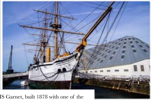
Royal Navy Sloop HMS Garnet, built 1878 with one of the massive sheds in the background in which ships used to be built

Another very enjoyable trip. 46 members joined us for the trip Chatham Historic Dockyard. This is a former Royal Naval dockyard on the River Medway. It came into existence as result of the reformation in the 16th century when relations with the catholic countries of Europe were at an all time low.