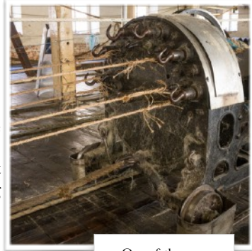
One of the rope making machines

We also visited the Ropery where rope has been made for the last 400 years and we watched a demonstration of rope making. The Ropery building is ¼ mile long and staff use bicycles to get from one end to the other. A lot of rope is still made here using the original machinery and techniques.